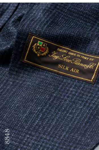
Wool-silk-cashmere blend: wintery glenchecks in blue (by Loro Piana) and brown with the soft hand feel of cashmere, lightweight lustre of silk and breathable properties of high-quality wool.