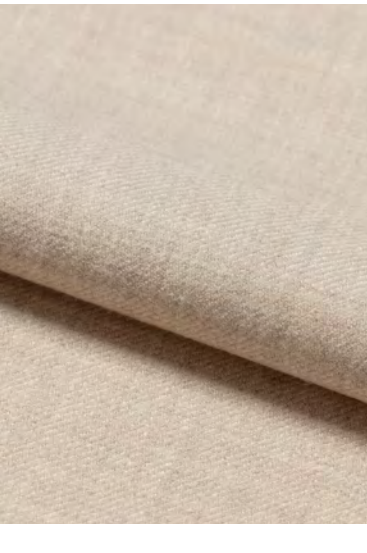
Stretch wool flannel by Loro Piana: nothing says winter like a well-made flannel. Softly brushed, comfortable and cosy, with all the benefits of natural wool.